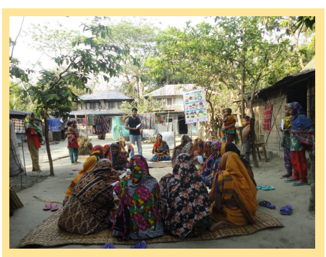
© Manika Saha, 2015, Wazirpur, Barisal

Under both the IAHBI and the poultry project, a series of training manuals and BCC materials were developed on horticulture, agriculture, aquaculture, livestock, and food-based nutrition, where nutrition was the main focus for each sectors. For nutrition education, both projects developed "A Manual of Food Based Nutrition". The manual contained several topic sections which covered the basics of food and nutrition, undernutrition, maternal, child and female adolescent nutrition and care, hygiene and sanitation, and cooking techniques. Training on nutrition was delivered as a part of the Integrated Training Programme. The manual was prepared based on existing materials and