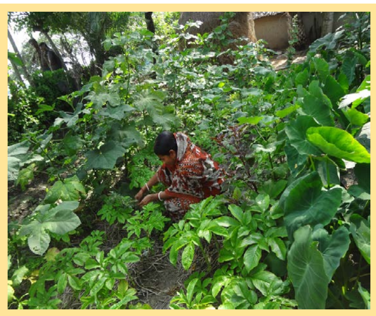
© Dr. Shahida Parul, 2015, Woman farmer working in her homestead garden.

Fertilizers and tools were distributed as a part of the inputs package. The inputs were selected from a nutritional point of view with the seven to eight varieties of seeds per season providing foods that are rich in Vitamin A, Vitamin C, and Iron. The direct effects of the horticulture intervention are increased vegetable production, family consumption, and income. In addition, seed preservation, knowledge and skill development, neighbour motivation, and strong linkages with DAE and beneficiaries are indicators of future vegetable cultivation expansion in the homestead area.