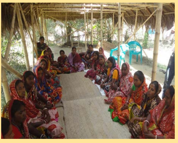
Nutrition training being conducted with a Women Farmer Group in Khulna.

The basis of FFS is a group of farmers with common interests who engage together in a season-long study programme with weekly meetings and practical demonstrations. The FFS in IAHBI not only taught farmers how to improve the productivity of their crops, livestock, and fishery operations but also how to specifically improve nutrition. It is an extension methodology that can be adapted to incorporate nutrition education and promote better nutrition practice among participants.