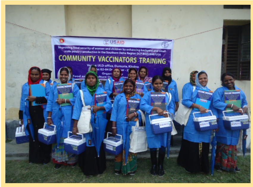
© Md. Habibur Rahman, 2015, Khulna, Training on Community Vaccination Training for women vaccinators.

are now earning money and giving vaccines to their neighbours' poultry and have built good relationships with DLS through using their vaccines. This provided an opportunity to create linkages between women farmers and livestock extension staff.