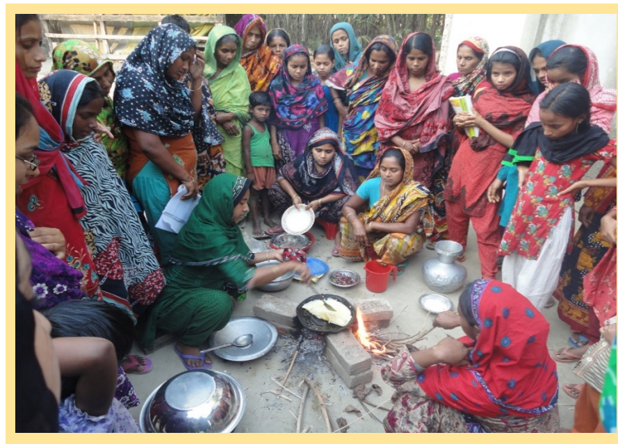
2016, Khulna, Cooking demonstration session by WFGs

The goal of cooking demonstrations in the two projects was to teach principles of food preparation; how to reduce nutrient loss; how to improve vegetable preparation, cooking, and blanching; and how to use different ingredients for enriching a given dish. Par-