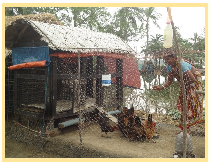
2015, Khulna, Woman engaged in poultry rearing utilizing a backyard poultry shed provided by the project.

The poultry project designed and supplied portable well-ventilated and easy-to-clean improved poultry houses for the backyard poultry farmers. The project also provided basic supplies, including bags of feed (10 kg per bag), plastic drinkers for adult birds and young chicks, plastic feeders, and sachets of anthelmintic<sup>5</sup> (de-worming powder) (10 g per sachet) to the 2900 backyard beneficiaries. In the poultry