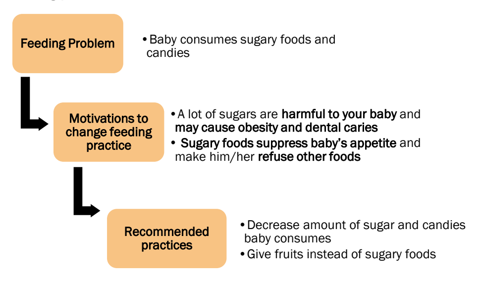
Figure 3. Motivations and recommended practices to address sugary foods and candies as a feeding problem