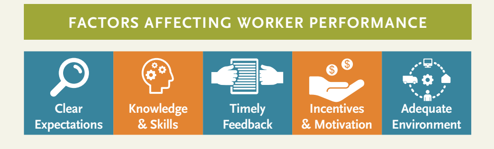
Figure 3. Factors Affecting Performance of Providers of Nutrition-related Services

The essential role of any organization, ministry, or system, as previously described, is to provide a vision of quality nutrition services and a clear managerial structure with roles, responsibilities, and specific expected