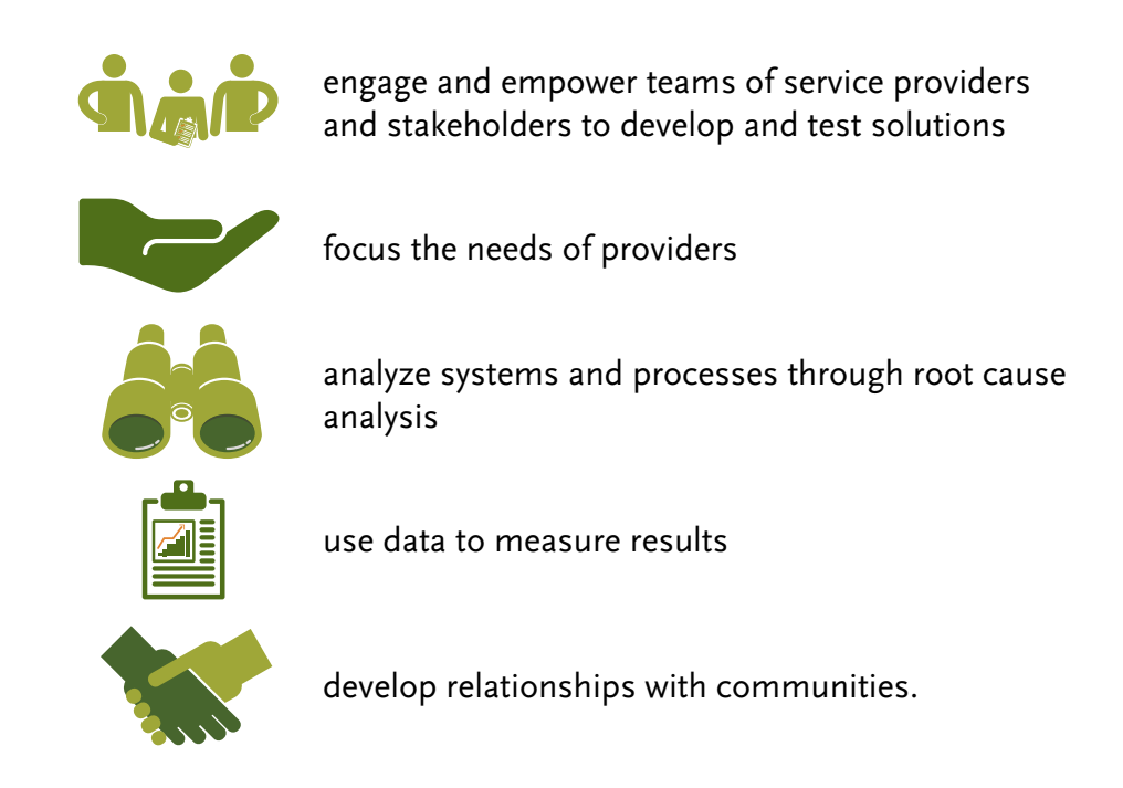
See Capacity Assessment in the Resources section.

Team-based approaches, such as QI or performance improvement (PI) have also become important contributors (Winch et al. 2003; The ACQUIRE Project 2005). Typically, these approaches—