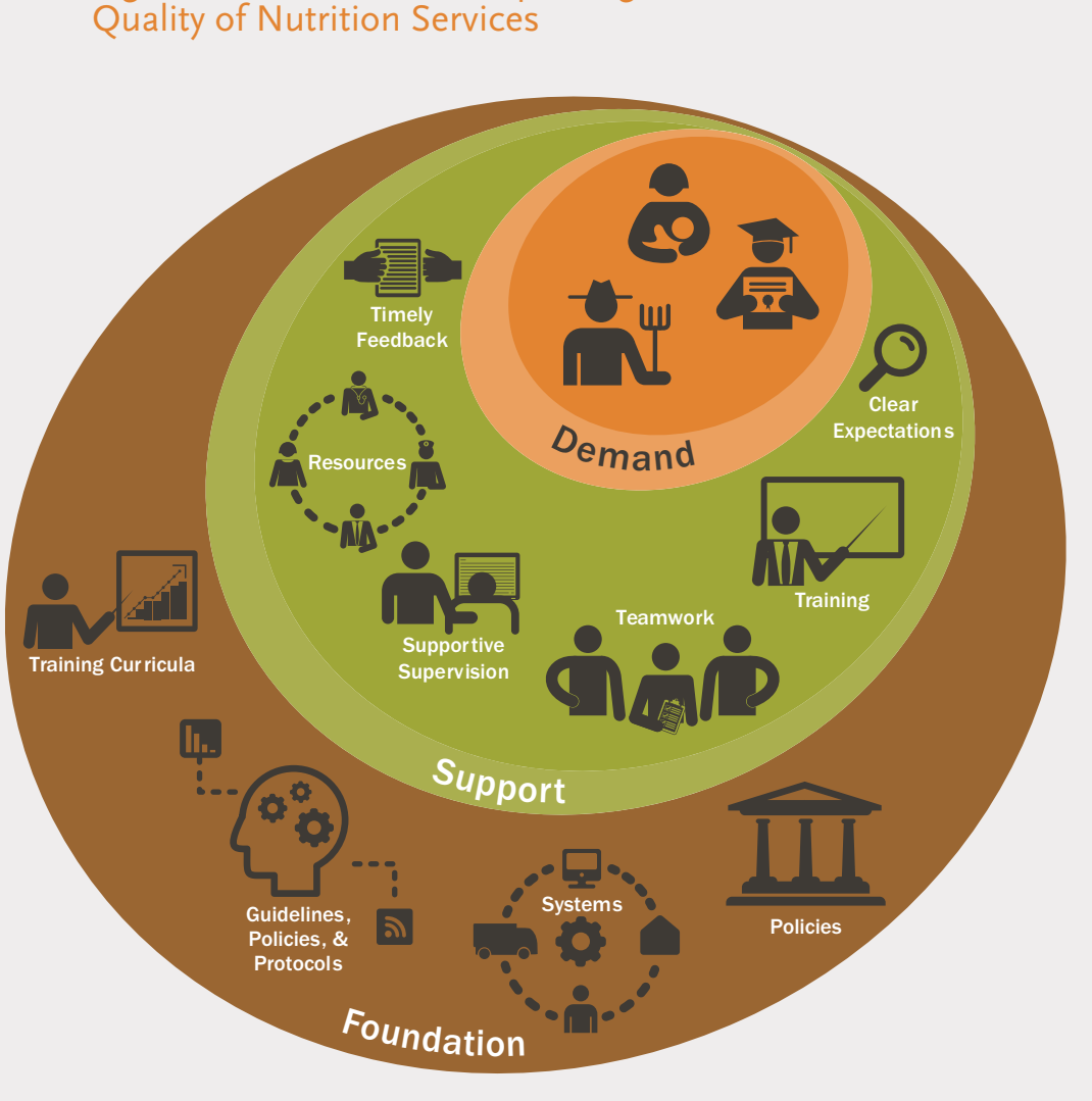
Figure 1. Framework for Improving the Nutritional Status and Quality of Nutrition Services

• A strong foundation facilitates the provision of nutrition services. Often referred to as an "enabling environment," this foundation