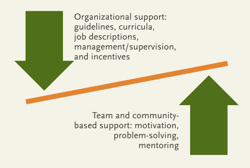
Figure 4. Cooperative Support

With the increased recognition that traditional training and supervision are difficult to implement effectively and therefore may have little impact on the quality of services delivered, countries are exploring alternatives. While there is no silver bullet for supervision, some countries are changing their approach to rely less on distance supervisors who are rarely at the frontline and more on local resources—facility managers, community committees, community members, and peers to close some of the gaps. For example,